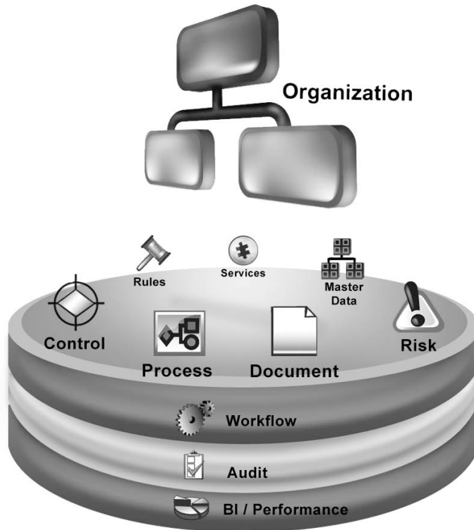
Figure 4: Interfacing Enterprise Process Center® Modules