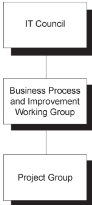
Figure 1: 'us' – Utility Services BPM Governance Structure